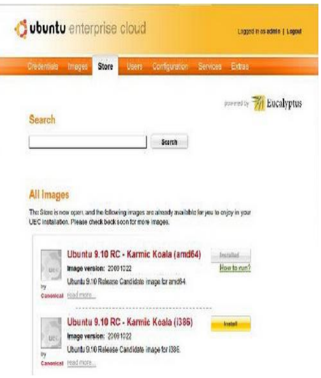
Figure 8.1. UEC Management Software

In the process of installing Eucalyptus, a few problems were encountered and as such required joining forums as well as searching on Google for assistance.