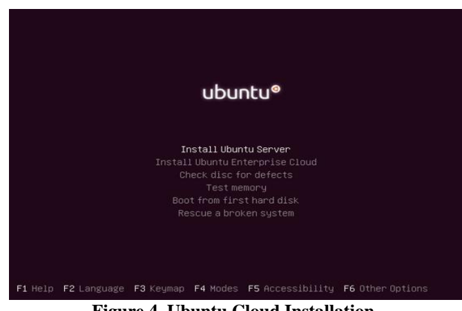
Figure 4. Ubuntu Cloud Installation

in two ways: it could be done either by installing an Ubuntu Cloud CD or an Ubuntu Server CD. For this purpose, we chose to install the Ubuntu Server CD and selected the open SSH server to be installed by default to enable remote connection to the front-end machine. Fig. 7 shows the Ubuntu cloud installation.