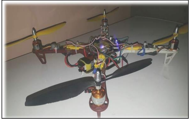
Fig. 3: Final version of the developed quad-copter with set of MQ sensors

The results show better UAV performance and more accurately response to the control commands set by the RC. However, we faced other problems regarding synchronized movement of all propellers. Therefore, we decided to replace all ESCs and after testing the UAV, the results show correct response of the UAV according to desired commands issued by the operator. Fig. 3 shows the final version of the developed quad-copter with the set of MQ sensors.