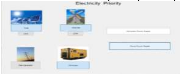
Figure 5: Priority 4 – Generator Power Supply

Case 4: When none of the energies mentioned above are unavailable then the AC loads are operated by the battery.