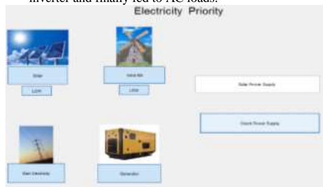
Figure 2: Priority 1- Solar Power Supply

Case 1: When all the four energy sources are available, our priority switches to solar energy i.e. we are extracting DC from solar system and then it is fed to battery and further converted into AC with the help of inverter and finally fed to AC loads.