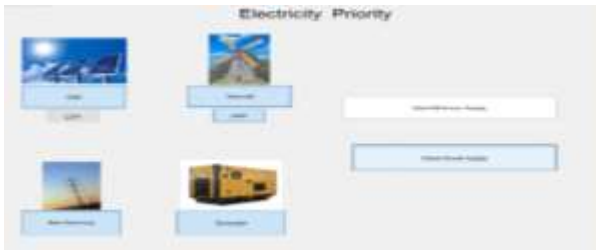
Figure 3: Priority 2- Windmill Power Supply

Case 3: When both the renewable energy sources are absent, the priority goes to AC mains which will supply to the AC loads.