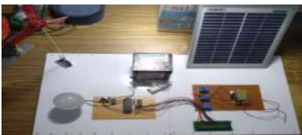
Fig. 3.11 Hardware model

The system employs three sources of energy to charge the battery i.e. solar energy, wind energy and ac mains supply. An electronic adopter is used which converts 220V AC into 12V DC to operate the basic circuit board. The filtration of this 12V DC is done by an electrolytic capacitor and a resistance connected across the voltage regulator LM7805 which further maintains the voltage at 5V. Microcontroller is used as a charge controller which controls the charging and discharging of battery. It also prevents overcharging of the battery. A crystal oscillator is also connected under the microcontroller which provides clock pulses to synchronize all the flip flops. When the sunlight falls on solar panel it produces electrical energy and it charges the battery through the charge controller. Similarly, when windmill rotates, battery is charged. But when both solar panel and windmill operates simultaneously then the power of individual sources is compared with a reference value with the help of an operational amplifier