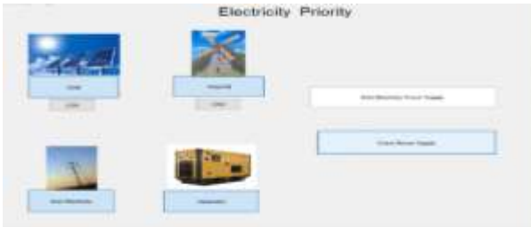
Figure 4: Priority 3 – Main Power Supply

Case 3: When both the renewable energy sources are absent, the priority goes to AC mains which will supply to the AC loads.