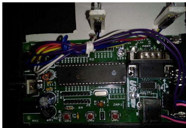
Fig1: Circuit design with IR sensors.

The camera frames can be collected or ignored based on the change in the each video frame. When there is motion inside the classroom then frames are collected else ignored, so effective storage utilization is accomplished.