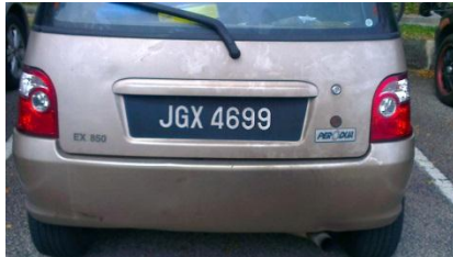
Figure 5: Input Image 2