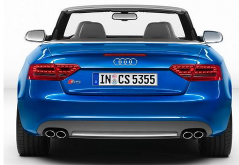
Figure 3: Input Image 1