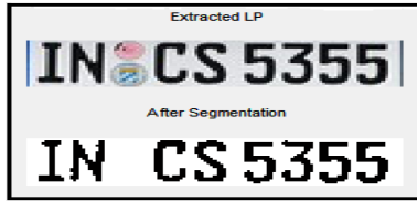
Figure 4: Output using Pixel Connectivity