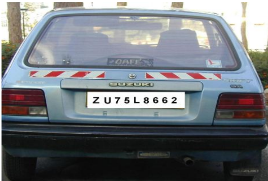
Figure 7: Input Image 3