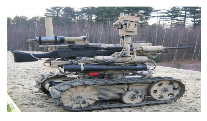
Fig. 2 Camel Robot