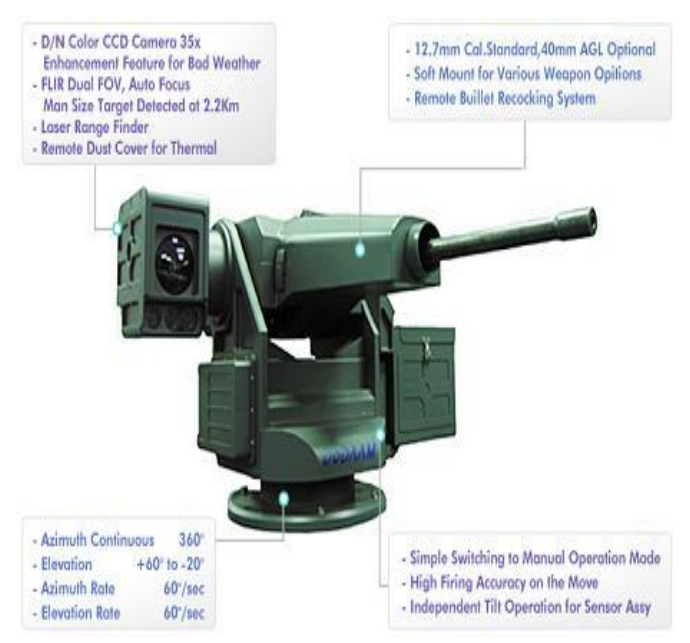
Fig. 1 Super Aegis F2

But the biggest disadvantage of this robot gun is that it is stationary built on a particular base which cannot move.