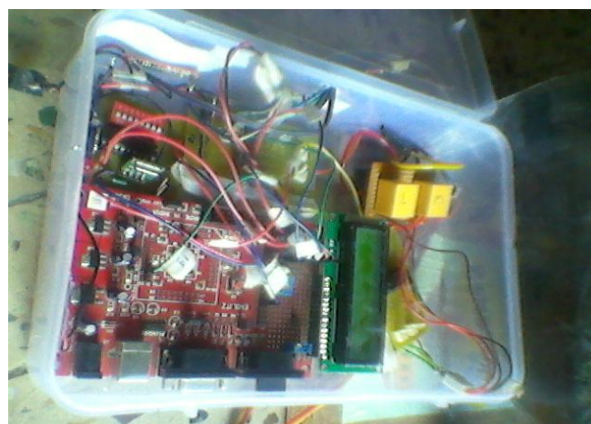
Fig.4 the microcontroller unit and other circuitry (transmitter section)

If the temperature level is below to its standard value then The light source will start.