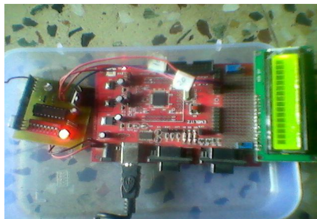
Fig. 5 receiver section

In fig. 4 the microcontroller unit and other circuitry has been presented, in this whole unit the ARM microcontroller (LPC2129) is used and we have motor driver & relay circuitry, RF transmitter section with encoder circuit (HT12E) for transmitting data, & the sensors for analyzing the actual condition of greenhouse and they will be connected with microcontroller unit and a LCD screen for seeing the data. Motor drivers and relay circuitries will operate the whole output devices.