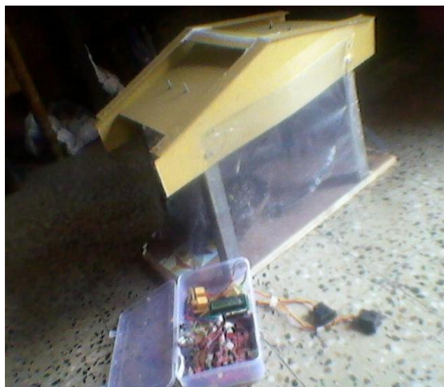
Fig 3.model of crop protection and monitoring system

Every crop has its own standard & favorable conditions and on the basis of these conditions the production of crop depends, suppose if atmospheric temperature and humidity is increasing from its standard value then on that condition the shade's DC motor will start and open the shade and the exhaust fan will start. If temperature or humidity any of them is high then this condition will be performed. Similarly if the humidity is decreasing from its standard value then shade will be closed & exhaust will be off, when humidity & temperature is in normal condition then shade will be closed, exhaust will be off, and water pump will be off. If atmospheric temperature is going below to its standard level then lights will be start and shade will be covered and exhaust fan will be off. If soil moisture level is going below to its standard level then the water pump will be on and if moisture level is going high to its standard value then water pump will be off. Sometimes if heavy rain is occurring from last 3 to 4 days and the atmospheric conditions are so bad and temperature is very low so on that condition plants have a requirement of photosynthesis without photosynthesis they can't be grown, on this condition we will give an artificial light source to the plants.