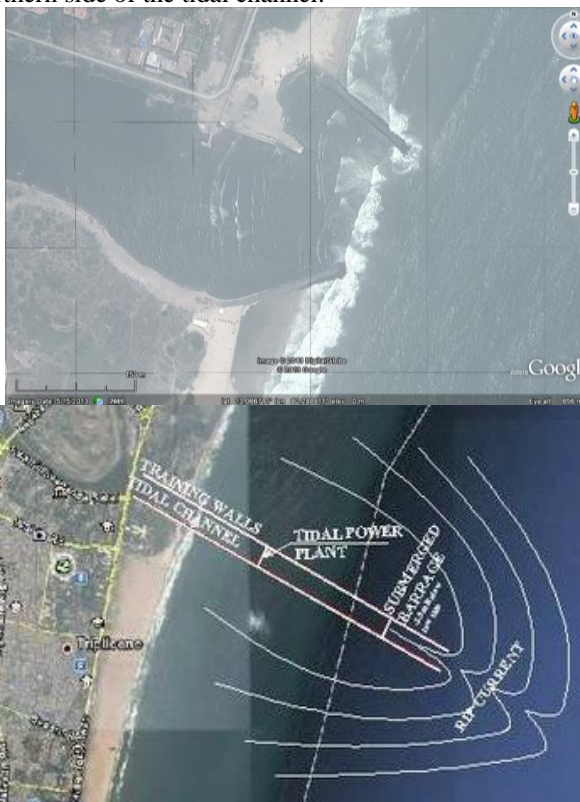
Fig. 1. Coovum River mouth groins constructed lying within surf zone breaking waves carry sediments into the tidal basin. Fig. 2. Locations of training walls, tidal plant, submerged barrage and development of rip currents to arrest dissipation of sediments outside the tidal channel are seen.