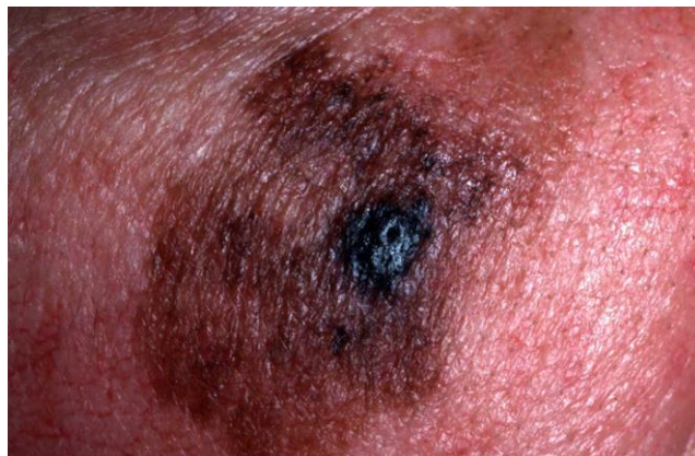
Figure.1 True image identification of skin cancer

image for skin cancer identification. The skin cancer images as a rule contain fine hairs, clamor and air bubbles. These feature that is not part of the cancer cell and would reduce the accuracy of the border detection or segmentation. The first step to do is apply some image processing techniques to the images. Thus pre-processing used to referring to remove the unwanted features on the skin and post-processing referring to enhancement to the shape of image.