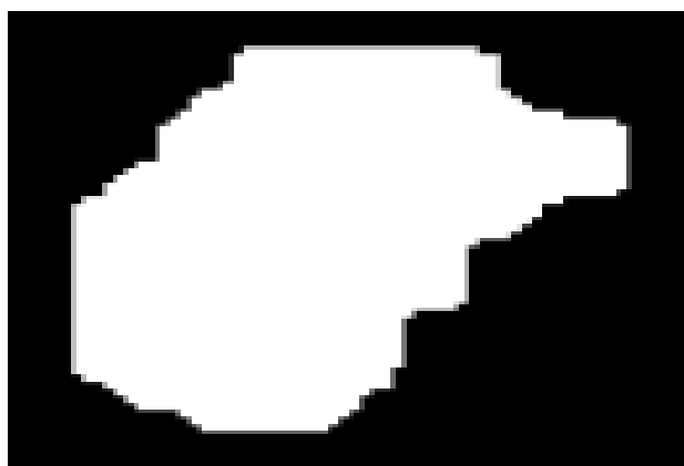
Figure.2 Segmented image

In this stage, the improved skin image is divided to isolate the tumor from the foundation (skin). Division expels the sound skin from the image and finds the district of intrigue. Generally the cancer cells stays in the image after division. Segmentation used here is Threshold Segmentation. Thresholding provides an easy and convenient way to perform the segmentation on the basis of the different intensities or colors in the foreground and background regions of an image. The input to a thresholding operation is typically a grayscale or color image. After segmentation, the output is a binary image. Segmentation is accomplished by scanning the whole image pixel by pixel and labelling each pixel as object or background according to its binarized gray level.